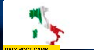
ITALY BOOT CAMP