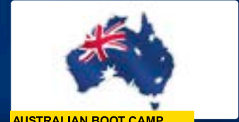
AUSTRALIAN BOOT CAMP